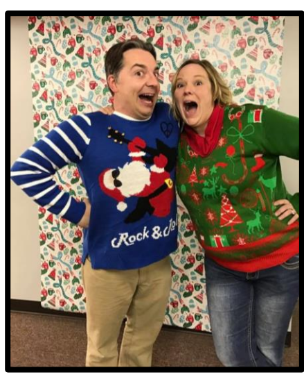
With these two at the helm, Weekend #36 is sure to be a joy!!