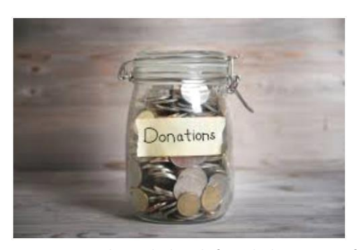
Donations can be made directly from the home page of our ALTD website.