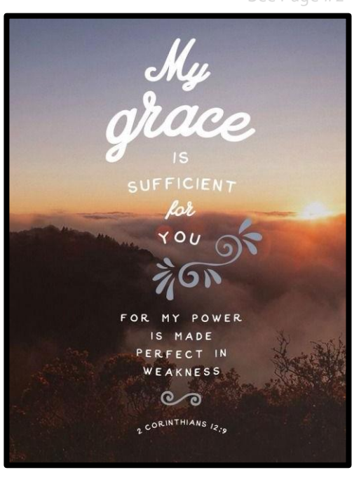
-Women's Weekend #36 Update-See Page #2